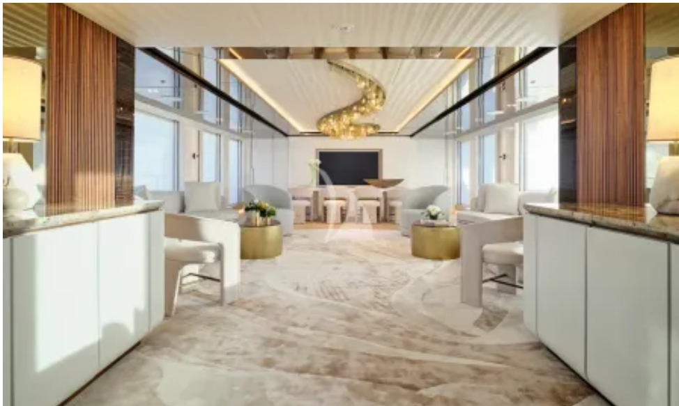
Main deck salon