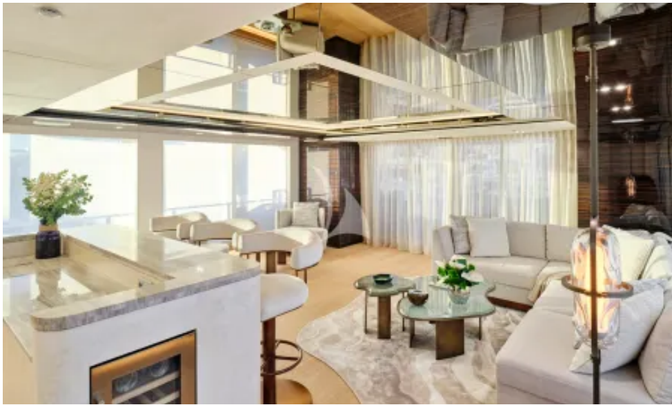
Upper deck salon