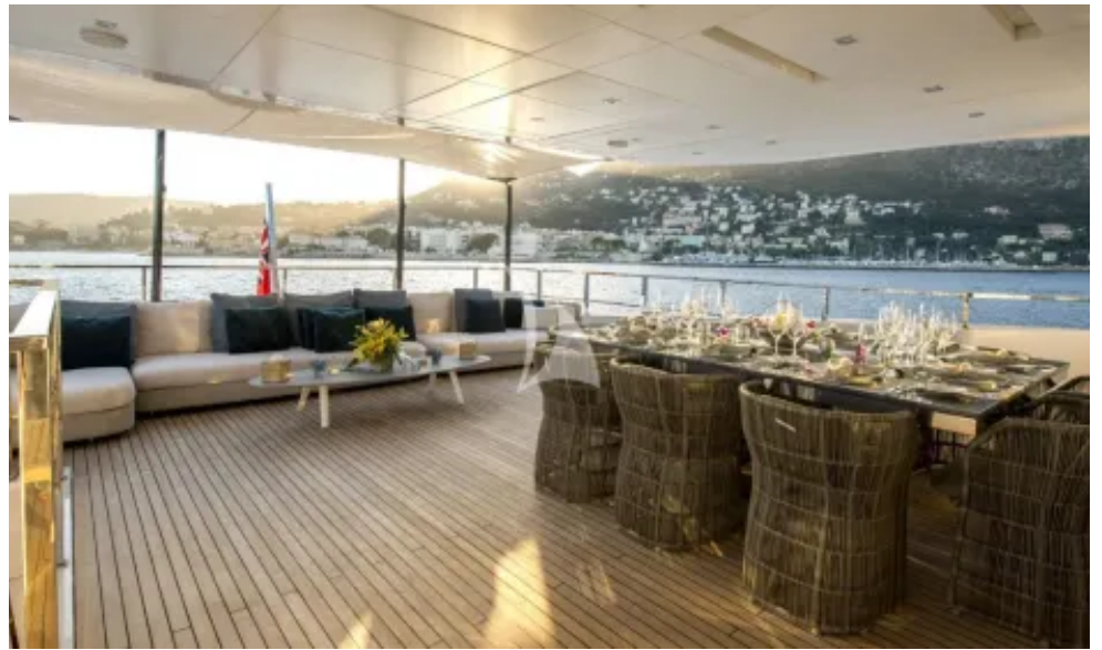
Upper deck dining