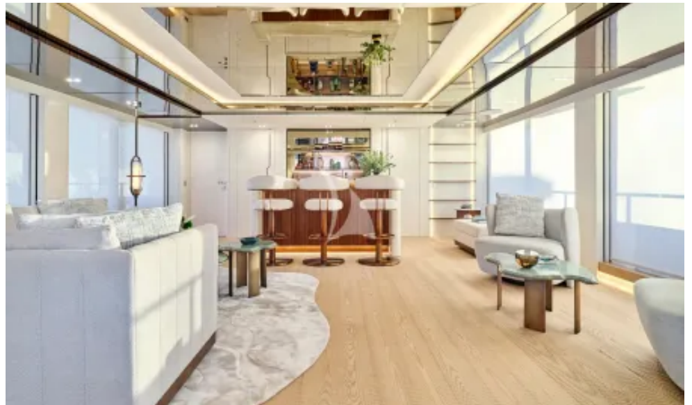
Upper deck salon